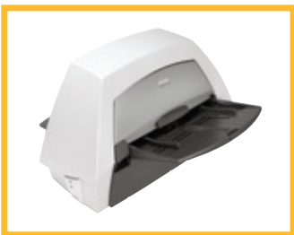
Kodak i1400 Series Scanners