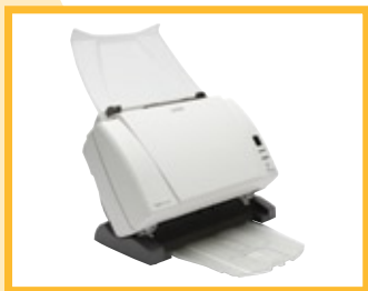
Kodak i1200 Series Scanners

Smart Touch functionality is built into all of these Kodak Scanners—