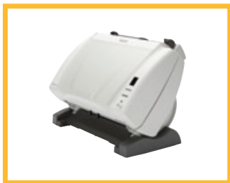
Kodak i1300 Series Scanners