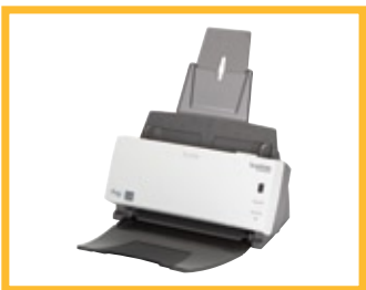
Kodak ScanMate i1120 Scanner

Find out more about Kodak i1200, i1300 and i1400 Series Scanners—plus the remarkably compact Kodak ScanMate i1120 Scanner (an ideal choice for offices new to scanning)—today. They all feature the Smart Touch functionality and all the advantages that come with it!